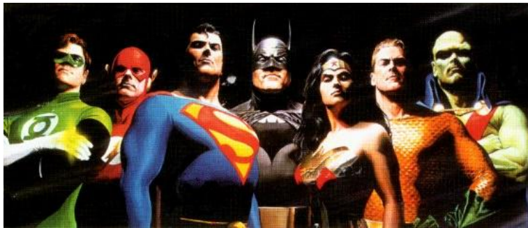
Superman, Batman, Wonder Woman, Green Lantern, Flash, Aquaman, & Martian Manhunter